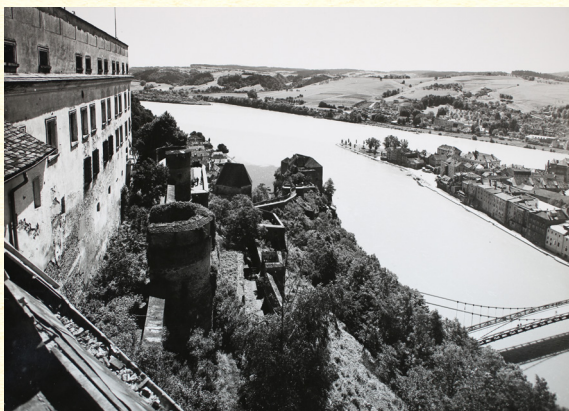
View of the confluence of the Danube, Inn and Ilz rivers from Veste Oberhaus, 1930s.

Hitherto unknown, partly unpublished photographs and archival sources show the turbulent history of Veste Oberhaus from the Weimar Republic to National Socialism and the period immediately after the Second World War. The many turning points in the history of the fortress between 1918 and 1952 also reflect the turbulent history of 20th-century Bavaria.