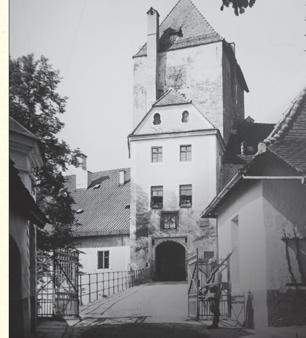
Veste Oberhaus, entrance portal, around 1910.