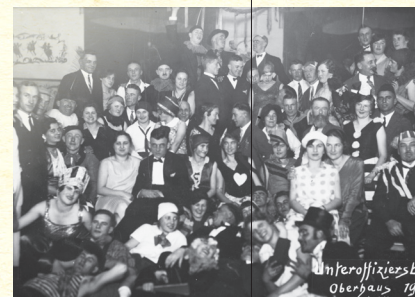
Non-commissioned officers' ball at Veste Oberhaus, 1930.