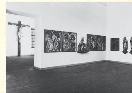
The Diocesan Museum, 1933 – 1937.

In 1932, the city of Passau establishes the Ostmarkmuseum at Veste Oberhaus. The ceremonial opening of the museum in May 1933 coincides with the beginning of Nazi rule. In the following years, the Nazis pursue a plan to transform Veste Oberhaus and the museum into a leading National Socialist cultural institution.