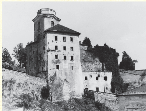
The General's Tower in the early 1950s.

The early years of Germany's "economic miracle" are also a new start for Veste Oberhaus. The people of Passau make big plans for the future of their fortress and are not deterred by the need to renovate the historic building. Today's Oberhausmuseum opens in 1952.