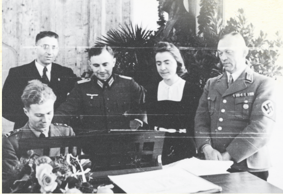
Presentation of the Culture Prize of the City of Passau on December 8, 1940 in the Knights' Hall at Veste Oberhaus.