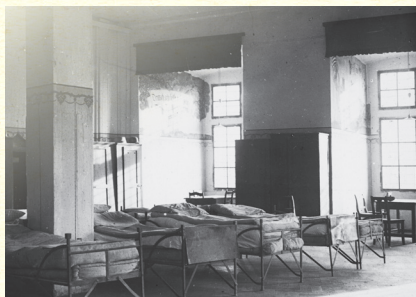
The Knights' Hall as a barracks hall in the 1920s.